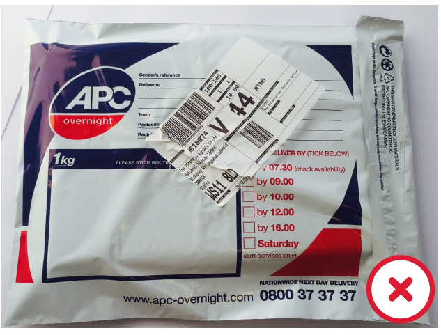
Ensure that the label is not placed outside the dedicated box area and it is flat and clear to read. creased barcodes will not be recognised by our system and can cause delays to delivery.