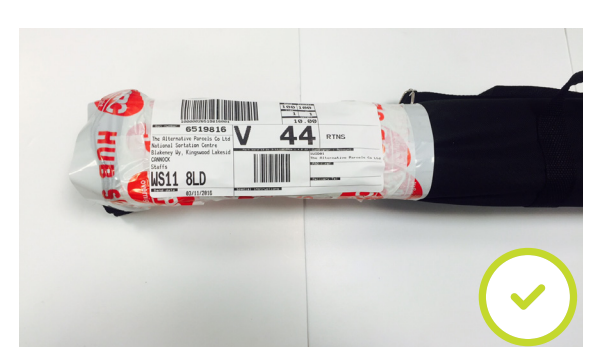
Canvas surface products must be taped at one end and then label applied ontop of the tape.