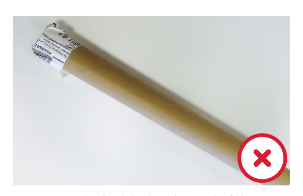
Do not apply the label at the end of the tube, as the barcode is unreadable.