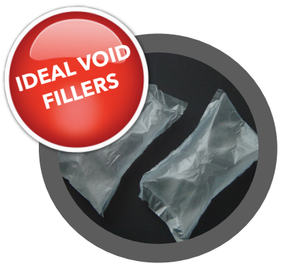
Air bags Void filler.

Good for cushioning, void filling and as a divider, this material is for lightweight