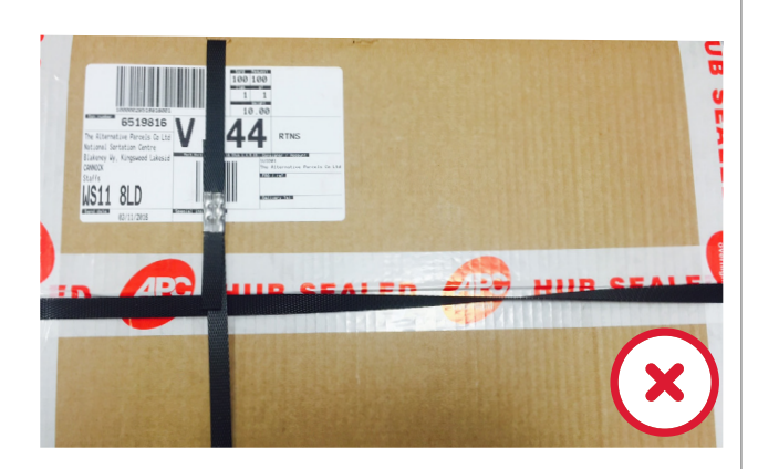
Strapping should not cover the barcode on the

Labels should not be placed in a document holder or a plastic wallet as reflections from the plastic means that the sort scanners will not read the barcode,