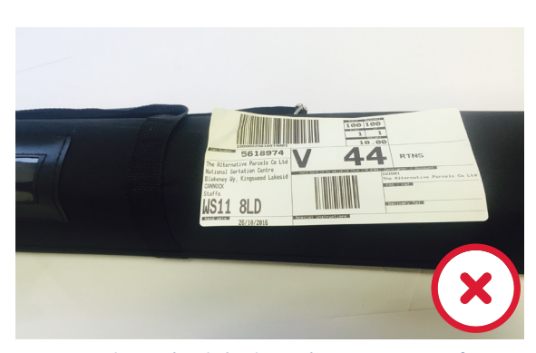
Do not place the label on the canvas surface as it will peel off easily.