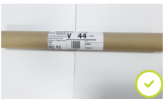
Always apply the label across the tube, ensure the barcode is straight and does not over lap.