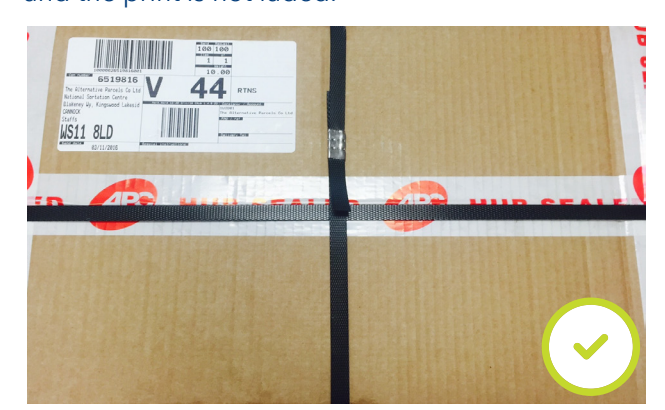
Strapping should always be placed away from the label.

Ensure that the label is printed correctly and that the print quality is high, low quality printed labels will make it hard for the scanner to scan the bar code presented on the label. Always ensure that the label has white space around the bar codes, and the print is not faded.