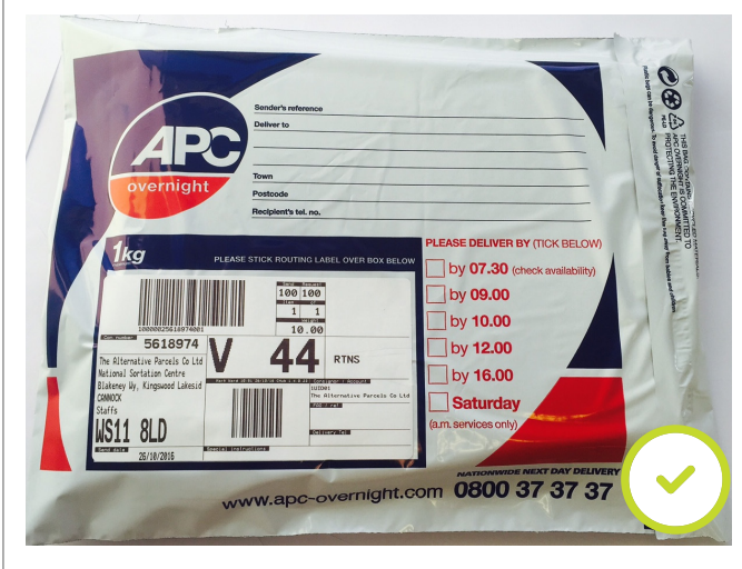
Make sure you apply the label in the box provided on the mailpacks.